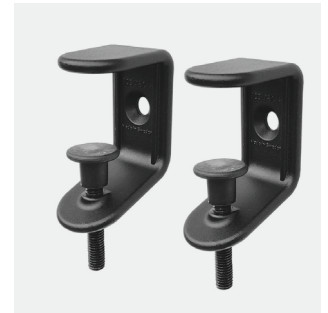
Clamp fittings Black, white or grey