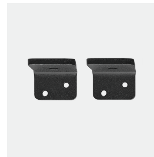
Hidden fittings Black, white or grey