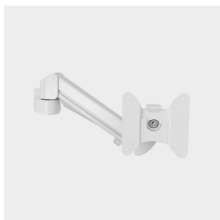
Monitor arm LC55