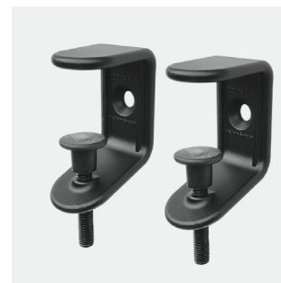
Clamp fittings Black, white or grey