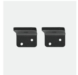
Hidden fittings Black, white or grey