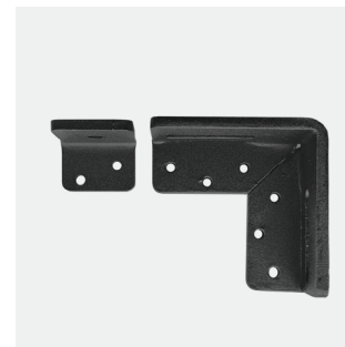
(2 x) Hidden fittings Black, white or grey