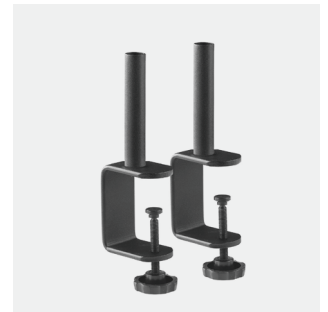
Clamp fittings Black, white or grey