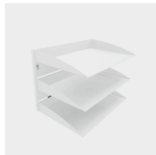
Sorting compartment 3xC4