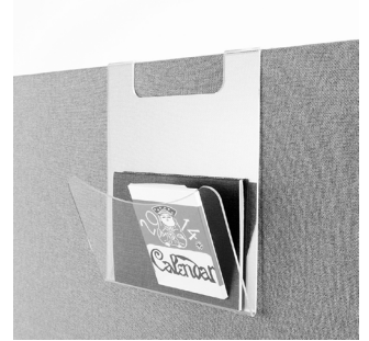
Plexi letter holder