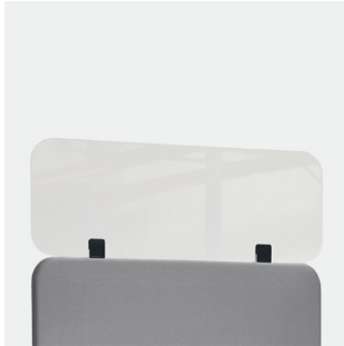
Plexi upper section 800/1000/1200/1400/1600/1800/2000 x285 mm