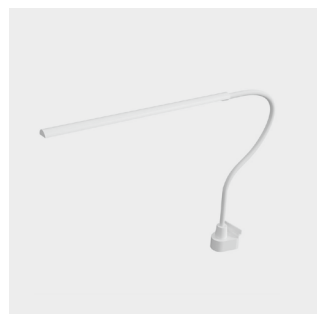
Flexible LED lamp