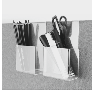
Plexi pen holder