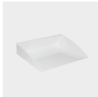
System shelf C4